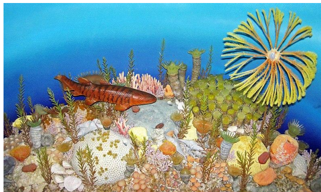
Figure 1 - Diorama of a Devonian Seafloor