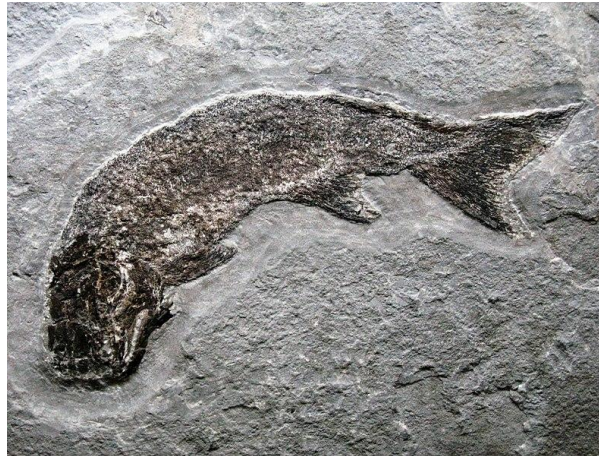
Figure 8 - Cheirolepis canadensis