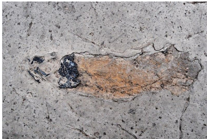
Figure 10 - Fossil Lungfish, Devonian Caithness Flagstone, Scotland

The rhipidistians, which appeared to have lived in estuaries and freshwater habitats, later split into lungfish and the tetrapodomorphs .