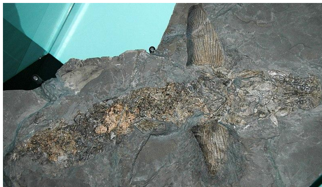
Figure 4 - Cladoseleche fylleri