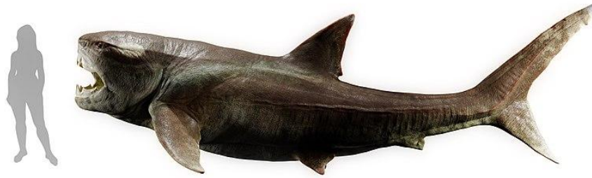
Figure 5 - Dunkleosteus terelli Size Comparison