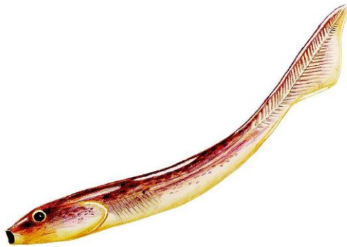
Figure 2 - Reconstruction of Palaeospondylus gunni

Among the earliest representatives of Chondrichthyes are Palaeospondylus gunni . First described from Achanarras slate quarry in Caithness, Scotland, Palaeospondylus gunni is a rare fossil and an unique example of the early fish on earth. Small in size, around six centimetres long, it had an eel like structure.