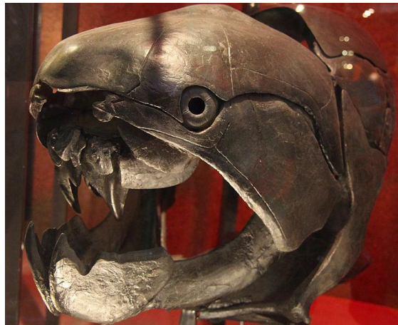
Figure 4 - Dunkleosteus terelli - Placoderm Fish Skull