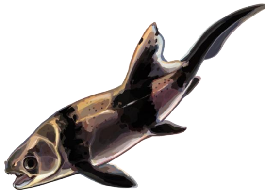
Figure 7 - Reconstruction of Coccosteus cuspidatus

Another arthrodire placoderm, Coccosteus cuspidatus lived during the Middle Devonian and is known from Devonian deposits in the Scottish Orcaadian Basin . Full grown specimens ranged from 20 to 40 cm in length and are often found in freshwater sediments.