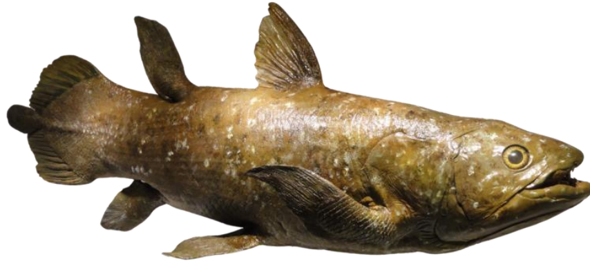
Figure 9 - Model of a Devonian Coelacanth, Houston Museum of Natural Science

fossil remains of coelacanths indicate that they thrived in open water ( pelagic ) ocean habitats during the Devonian and later Carboniferous . Although thought to have gone extinct at the end of the Cretaceous, two species of the genus Latimeria live today in the Indian Ocean, one species living off the east coast of Africa ( L. chalumnae ) and the other in the vicinity of Indonesia ( L. menadoensis ).