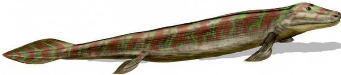
Figure 12 - Reconstruction of Tiktaalik