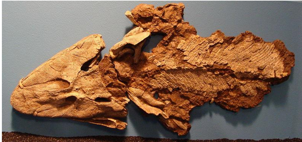
Figure 11 - Fossil Tiktaalik , Field Museum, Chicago

Among the earliest tetrapodomorphs to be found in a terrestrial environment was Tiktaalik sp. Found on Ellesmere Island, Nunavut, Tiktaalik appears to have been a lobe-finned fish that was capable of living outside the water. The fossil bones of Tiktaalik have basic wrist bones and simple rays reminiscent of fingers.